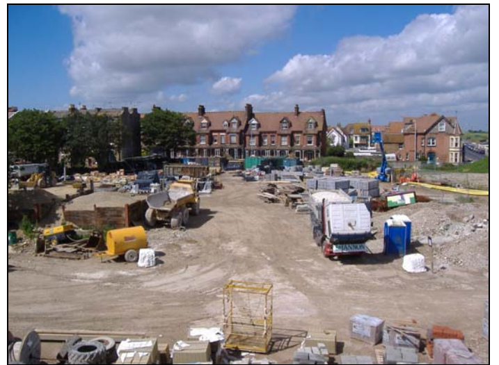
The site for Erasmus Court (houses in Westbrook Gardens can be seen in the background)