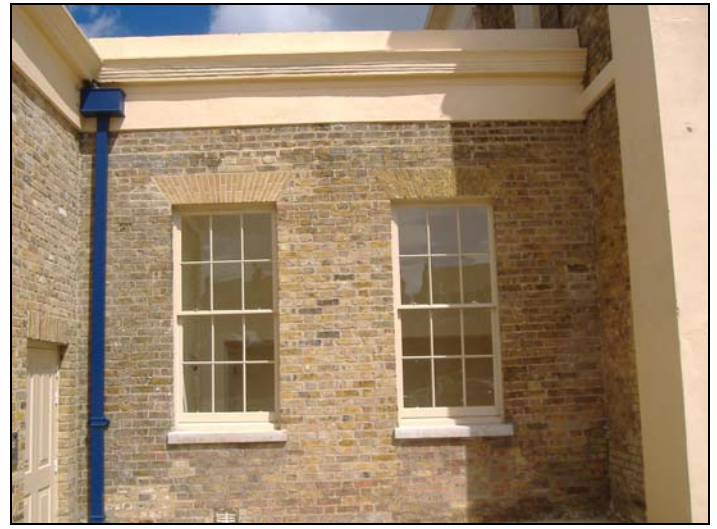
The replacement brickwork above the left-hand window exactly matching the original brickwork above the right-hand window. This is an example of the fine restoration work by Paigle Properties