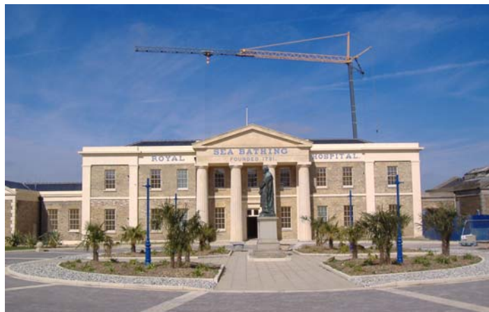
Former Royal Sea Bathing Hospital, Canterbury Road, Westbrook

This year, nominations had been received from Society members for twelve properties in Margate to be considered for Town Pride Awards. This is the highest-ever number of nominations received since the Society was formed in 1968 and indicates a growing awareness amongst the Society's members of the major contribution that both the renovation of often run-down properties and the erection of well-designed new properties make to the overall attractiveness of our town. The record number of nominations together with the high standard of the works had made the judging for the Society's prestigious annual awards particularly difficult. However, five properties were selected by the panel of judges to receive Town Pride Plaques and Certificates including the former Royal Sea Bathing Hospital building which attracted the highest-ever aggregate of marks from the judges since 1968.