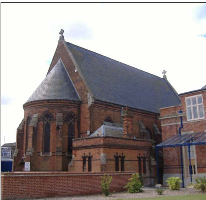
The former hospital chapel which, it is hoped, will become available for community use