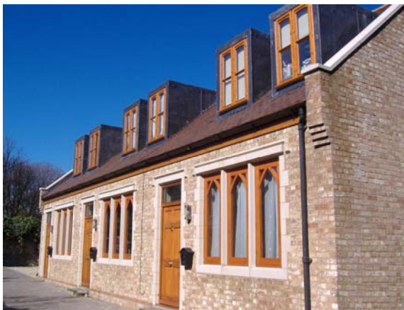
Wheatley Place, off Victoria Road, Margate