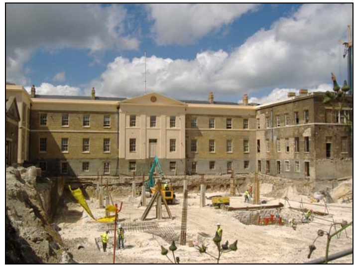
Alexandra Court seen from Westbrook Road showing the groundworks for Charlotte Court