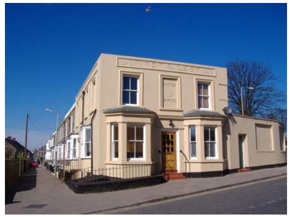
The former First & Last Public House, Vicarage Place, Margate