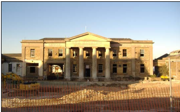
Work underway on the first underground car-park – December 2005 (Note the removal of the bronze statue of Sir Erasmus Wilson which has now been replaced in its original position)