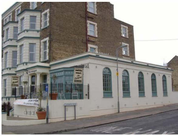
The Orangery, Smiths Court Hotel, Eastern Esplanade, Cliftonville