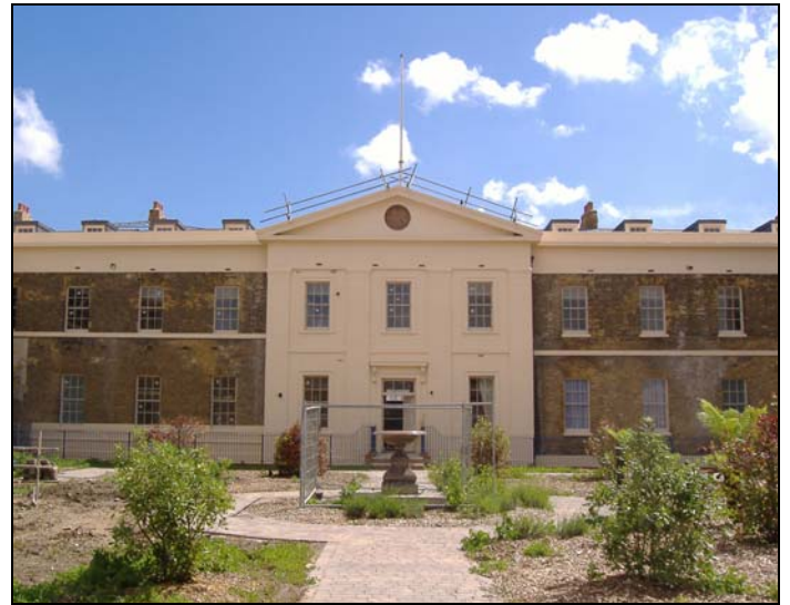
Alexandra Court looking east (inside quadrangle)