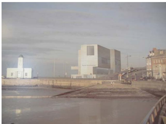
David Chipperfield Architects' proposal

On Monday, 18 th June David Chipperfield Architects presented, at the Winter Gardens, their latest design work for the new Turner Contemporary Gallery. Many members of the public took advantage of the opportunity to attend this third public meeting and to hear David Chipperfield present his proposals for the new gallery as part of the design development process. David Chipperfield explained that the ground floor would need to be two metres above existing ground level and that the building could be regarded as a cultural community centre with a north-facing terrace/balcony and an art gallery on its top (3 rd ) floor. There would also be a basement at ground level. The audience was told that building was expected to start in autumn 2008 with completion in 2010. The design received general approval from the audience although many expressed the view that the design was too angular. We were, however, told that a landscape architect will be appointed to advise on the whole area around the gallery. In answer to a question from the floor, we were told by David Chipperfield that there is no height restriction on this gallery. With the regeneration of Margate being largely dependent on the success of this project, let us hope that the building, when completed, will stand proud yet fit well into this most prominent location.