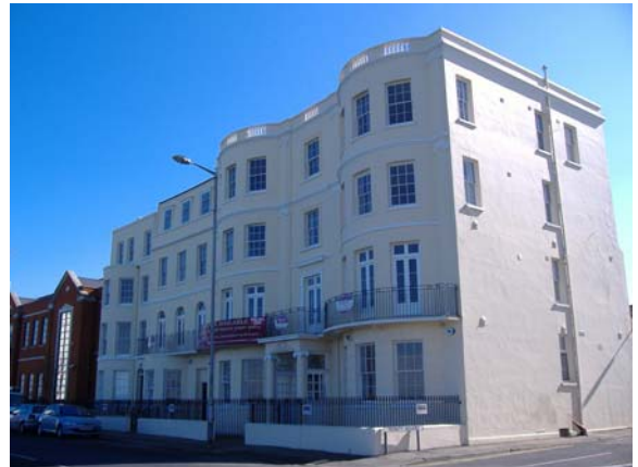
Temeraire Court, Fort Crescent, Cliftonville