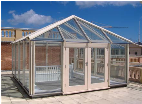
One of the conservatories on the top of Victoria Court