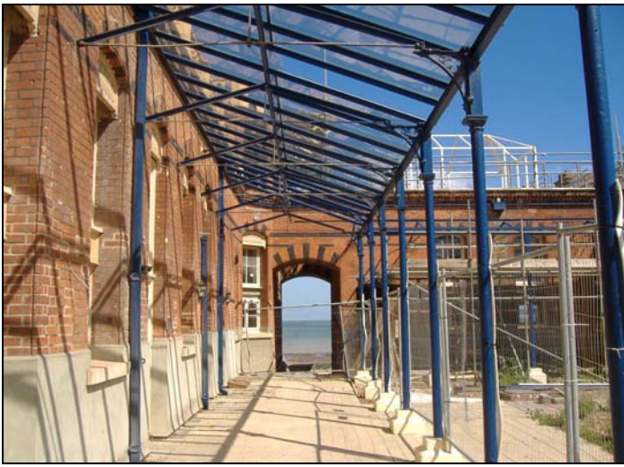
Victoria Court (looking northwards)