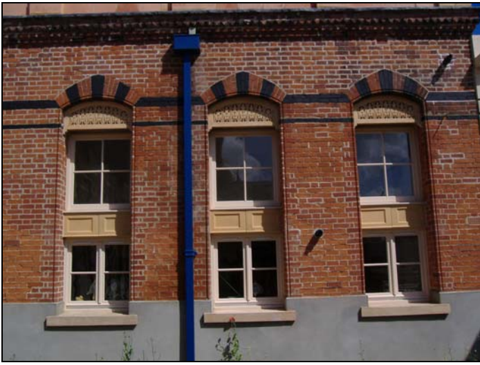
Decorative brickwork above some of the restored windows