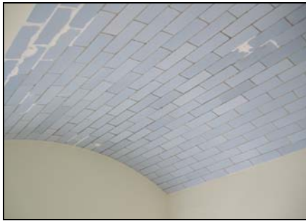
One of the original vaulted ceilings retained as a feature in a number of the apartments in Victoria Court