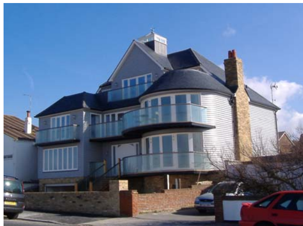
99 Sea Road, Westgate-on-Sea