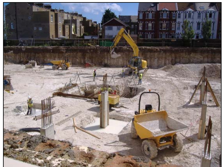
Construction work on the underground car-park for Charlotte Court (Sea View Terrace and Westbrook Road at rear)