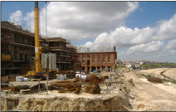
Construction work in progress on that part of Alexandra Court which faces the sea