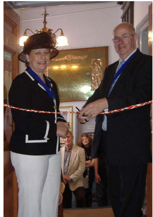
The Deputy Mayor & Mayoress cut the ribbon to formally open the exhibition