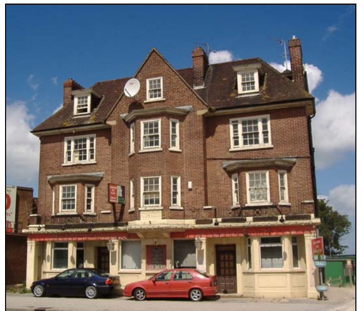
The former Dog & Duck Hotel currently being used by Paigle Properties as site offices. The future of this building seems undetermined