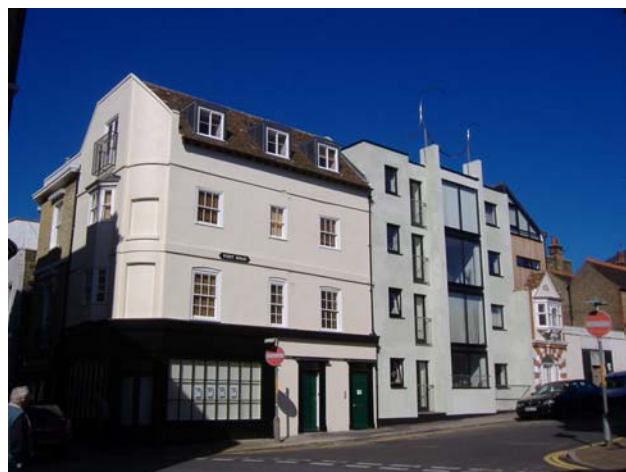
Former Olby's shop and new development incorporating the façade of the former Margate Ambulance Corps headquarters building