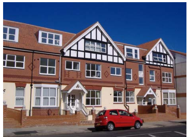
Highcliffe Hall, Eastern Esplanade, Cliftonville

In addition to the five Town Pride Plaques and Certificates listed above, Town Pride Commendation Certificates were awarded to the owners of the former First & Last Public House, Vicarage Place, Temeraire Court (formerly Fort Lodge Hotel), Smiths Court Orangery and Highcliffe Hall, Eastern Esplanade. Again, presentations were made by our President to the owners of those properties with the exception of the owners of the former First & Last Public House and Highcliffe Hall who were unavailable to receive their awards in person.