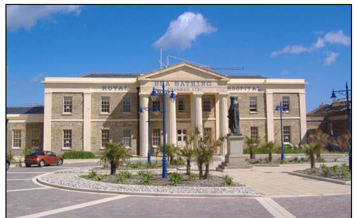
The forecourt and part of Alexandra Court facing the fine statue of Sir Erasmus Wilson now back in its original position – June 2007 (Note the restoration to some of the windows on the left-hand side)