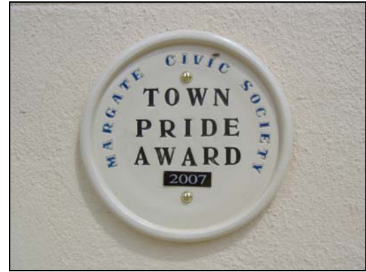
The Town Pride plaque awarded to Paigle Properties at the Society's meeting in May 2007 now proudly displayed at the main entrance to the old building