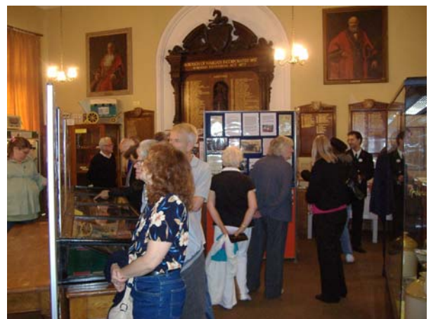
Some of the visitors to the exhibition on opening day