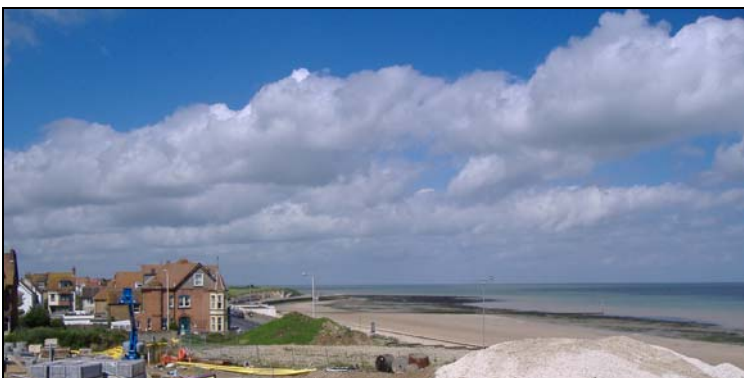
The magnificent view looking west from the top of Victoria Court